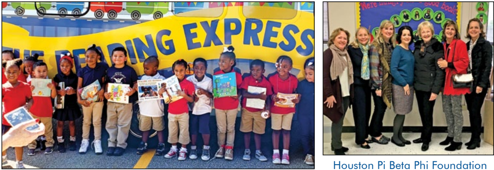
The Reading Express, Making it Better's newest program.

Lunch Bunch : A weekly program where trained volunteer mentors promote positive decision making and healthy relationships for third through fifth grade students. To find out more about these programs and Making It Better, please visit their website at www.mibtx.org.